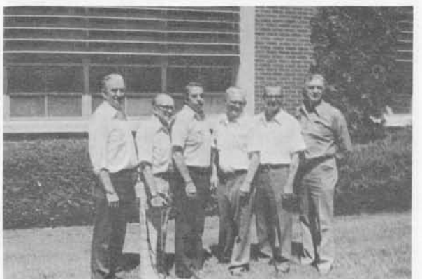
A typical class reunion picture.