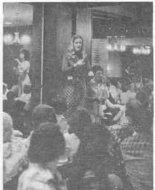
Indispensable interpreters at work.

A total of 370 people registered at the USD Reunion. Approximately seventy-five alumni came from other states such as Oregon, Idaho, Colorado, California, Nevada, Arizona, and Indiana. Will this record be broken in 1984 when USD marks its 100th anniversary with the second Reunion? Hopefully so! So long, farewell, auf wiedersehen, goodbye till the 1984 reunion!