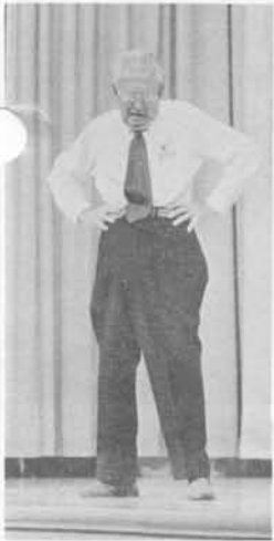
"Once upon a time . . ."

The committee sent over 50 invitations, thanks to Marlo Honey who printed the invitations. They were elated that seventeen of them were able to show up.