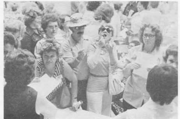
Yumm — yum, liver is tasty!

What did some of the men do when the ladies attended "back-to-school"? Men prefer to play, so there were several chess competitions for them.