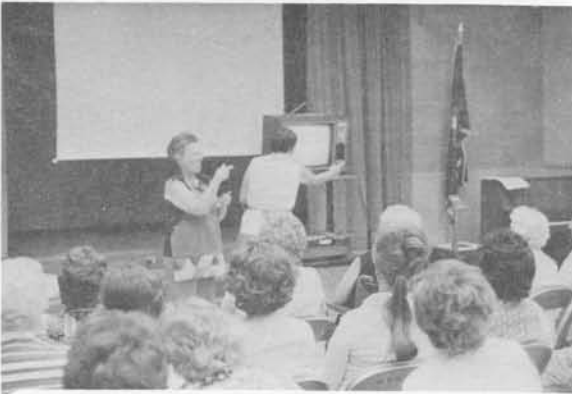
Modern captioned TV lesson.

What did some of the men do when the ladies attended "back-to-school"? Men prefer to play, so there were several chess competitions for them.