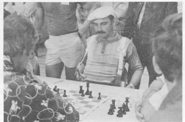
Thinking game in action.

Our lunch was detained for an hour because the catering service guy simply could not locate our school! Ogden has grown!