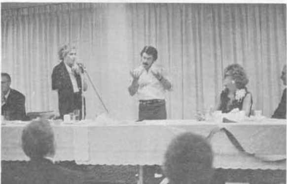
Comments from the general chairman.

parently made many people weep for they hated to bid one another goodbye.