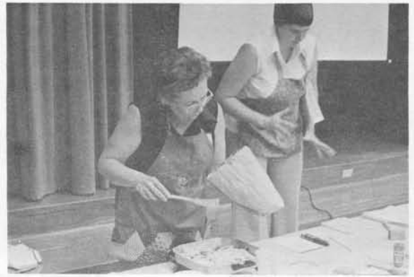
Cooking Spanish liver economically.

Multi-Purpose Room of Primary Hall. A 24-minute captioned video tape of an economist explaining how to be economical was shown. Then the two so-called instructors alternatively enriched the participants' knowledge on how to save money on meat. A demonstration on how to cook Spanish liver followed. The aroma of liver and onions attracted many outsiders nearby who were not attending this workshop. Surprisingly, many who loathed liver liked this dish. Materials such as recipes and booklets were distributed. According to evaluation it was highly enjoyed by all.