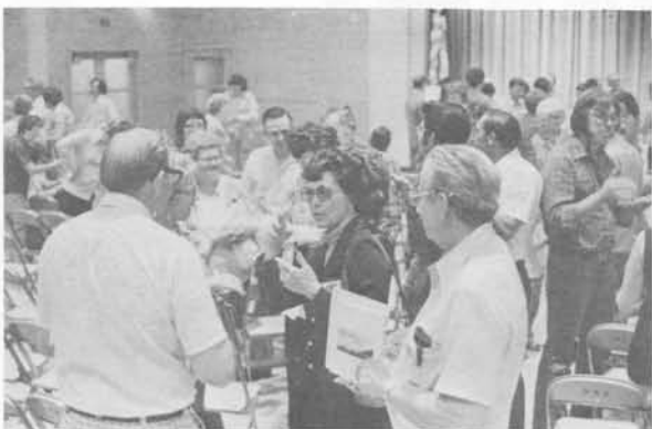
Sharing memories at the social hour.