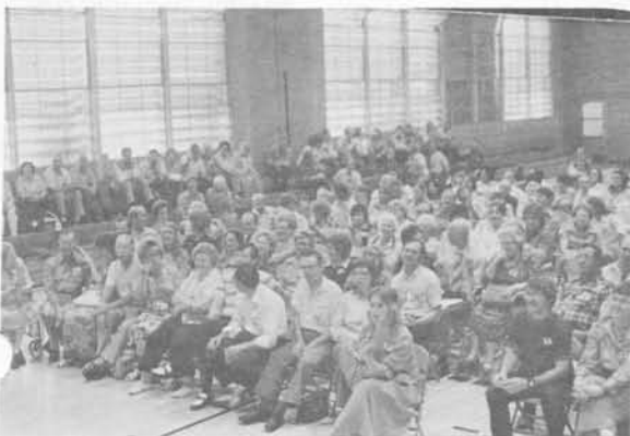
A captive audience, indeed!