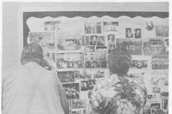
"Aaah, that's my old girl friend."