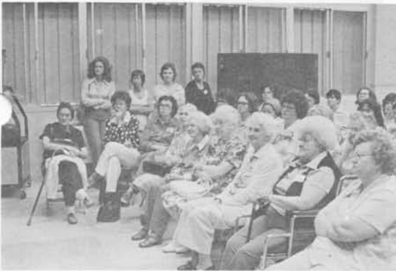
Learning is forever.

Multi-Purpose Room of Primary Hall. A 24-minute captioned video tape of an economist explaining how to be economical was shown. Then the two so-called instructors alternatively enriched the participants' knowledge on how to save money on meat. A demonstration on how to cook Spanish liver followed. The aroma of liver and onions attracted many outsiders nearby who were not attending this workshop. Surprisingly, many who loathed liver liked this dish. Materials such as recipes and booklets were distributed. According to evaluation it was highly enjoyed by all.