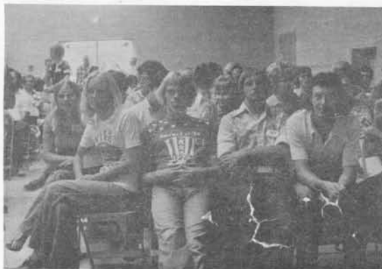
Youths are participating.