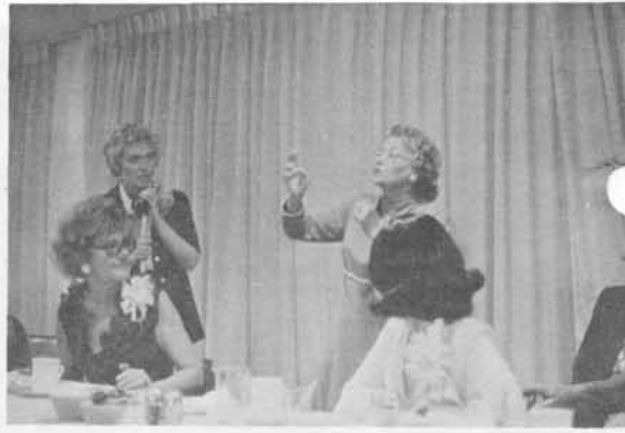
Signed songs are beautiful.