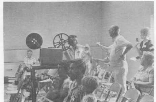
"Movies revive memories."