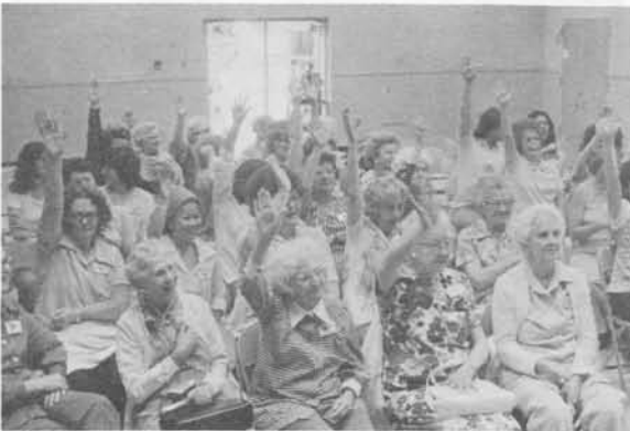
"Oh, I know the answer."

At eleven o'clock the alumni gathered behind the main school building for a group picture taken by Bell Photography Co., with 290 posing.