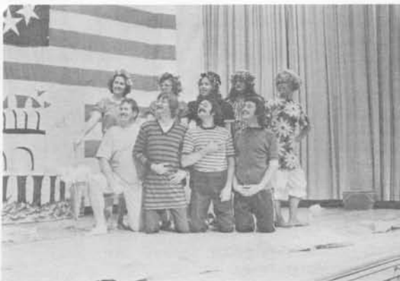
Smiling for the "1905" group picture.