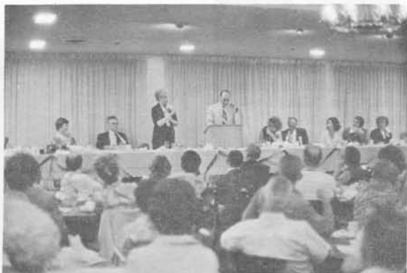
A trip in the Time-Machine.