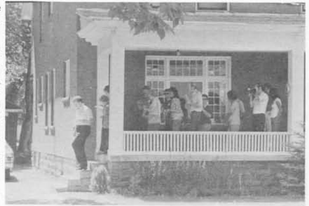
Friends, follow the leader.