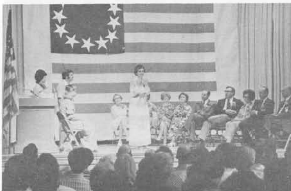
Honoring the USD staff members.