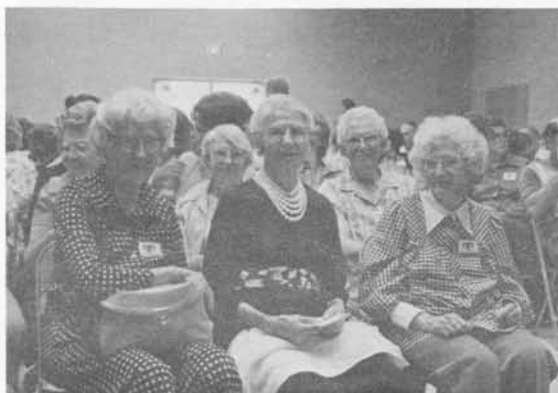
Keeping old friends . . .