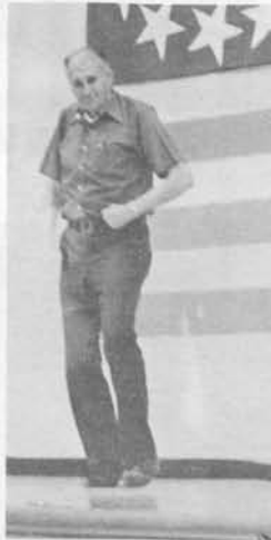
The hero or the villain or the heroine?