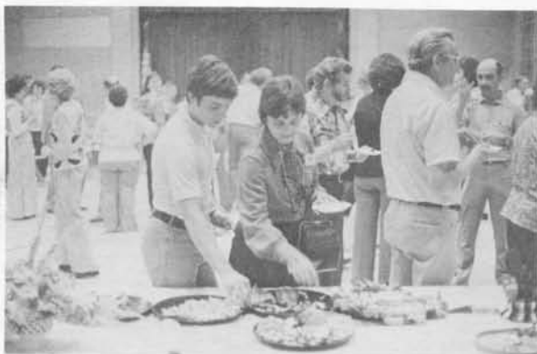
"One piece of each, please."