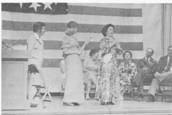
Profound gratitude expressed.